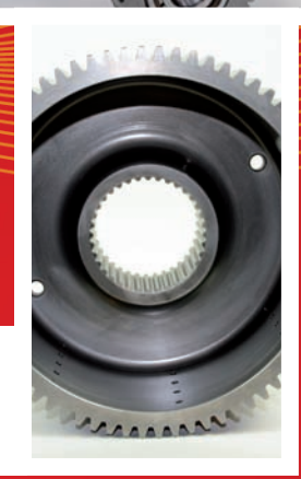
Our aim is to assist the customer with processing any requirement for special non-standard and bespoke components by offering great flexibility in production, high-precision machining, optimized delivery times, material certification, machining quality certification.